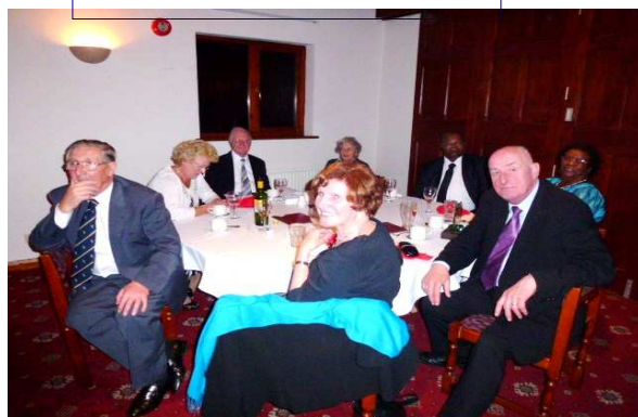
Some of the other guests during evening speeches.